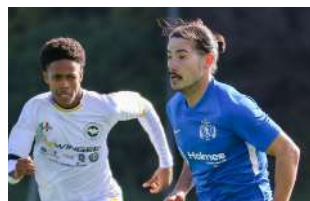
Playoffs are OFC Qualifiers v Auckland City